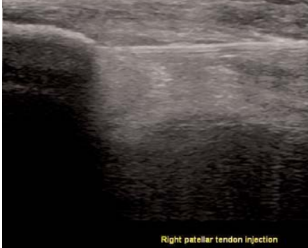
Right patellar tendon injection